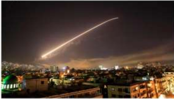
2018 Syrian missile strike Natal Chart 14 Apr 2018, Sat 4:00 am EEDT -3:00 Damascus, Syria 33°18'00" N 36°11'00" E Greenwich Tajem Abdullah Tajem

At 4:00 AM Damascus time (EEDT, -3:00) on the 14 th of April 2018, a coalition of French, British and American air and naval forces launched a missile barrage against Syrian targets in and around Damascus, supposedly to destroy chemical weapons facilities. The chart is below: